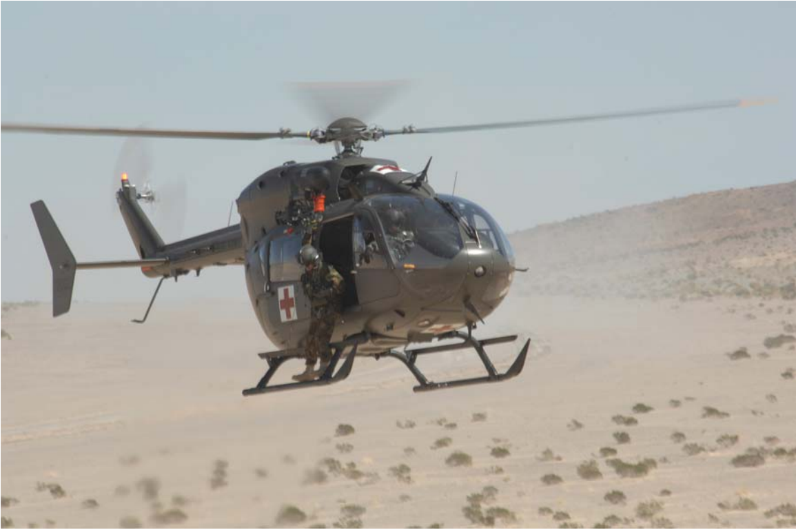
UH-72A Lakota Light Utility Helicopter.