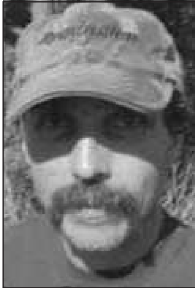
Photograph taken in 2006